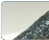
Osteria San Marco Calle Frezzeria, ITALIA, 30124

The deep wine list is the result of a fine selection of national and international staff in contrast to the common fashions of the moment, with a preference for small producers and local wines.