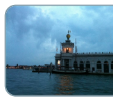
Punta Della Dogana ITALIA