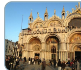
Basilica di San Marco Calle Canonica, Venezia, VENETO, ITALIA, 30124