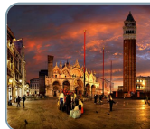
Piazza San Marco Piazza San Marco, Venezia, VENETO, ITALIA, 30124

In the morning, head straight to one of Europe's most beautiful squares, the canalside Piazza San Marco.