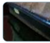
Isola di Burano Venezia, VENETO, ITALIA, 30142