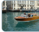
Venice Water Taxi