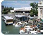
Stazione Venezia Santa Lucia 30100

Arrive at 11:30am with ground transport to your hotel. Transportation via water taxi will be waiting for you outside the train station.