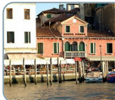
Hotel Canal Santa Croce 932, Vicenza, VENEZIA, IT, 30135

You can choose from these two recommended hotels. All options are exquisite and truly make you feel at home. Free WIFI and breakfast at all.