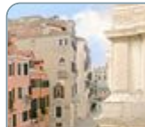
Albergo Bel Sito e Berlino - $155/night San Marco 2517, Venezia, VENEZIA, IT, 30124