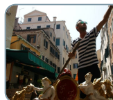
Gondola Ride On The Canals Of Venezia Venezia, VENETO, ITALIA