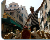
Gondola Ride On The Canals Of Venezia Venezia, VENETO, ITALIA

You might feel a little touristy, but this a gondola ride near sunset in Venice is truly an experience. You will feel like you were dropped directly into a movie.